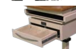
Optional Drawer System (1,2 or 3 drawers)