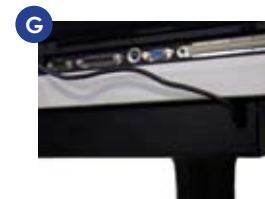
Power Block Cage